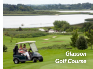
Glasson Golf Course

On the south-eastern shores of Lough Ree is Glasson Golf Club, boasting superb lakeside scenery and tour-quality fairways and greens. And nearby, in Hodson Bay, you'll find Athlone Golf Club which has been chosen many times by the Golfing Union of Ireland as a venue for competitions at all levels.