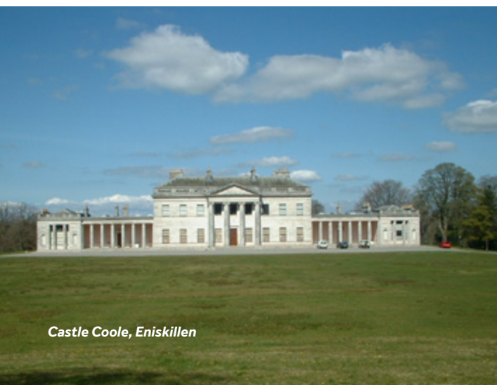
Castle Coole, Enniskillen