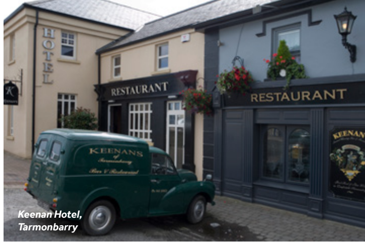
Keenan Hotel, Tarmonbarry

Cox's Steakhouse, located a short distance from Dromod Harbour on Harbour Road.