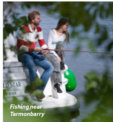
Fishing near Tarmonbarry

Amenities: You'll find a supermarket and pharmacy here.