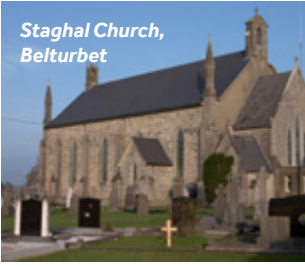
Staghal Church, Belturbet