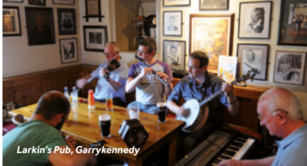
Larkin's Pub, Garrykennedy