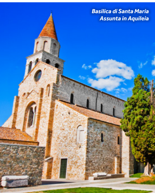
Basilica di Santa Maria Assunta in Aquileia

Moorings: About 2km downstream of the town centre is the Marina di Aquileia. Alternatively Marina Aquileia can provide moorings. Do not travel beyond the fork in the Natissa River – this is the last spot wide enough to turn your boat around.