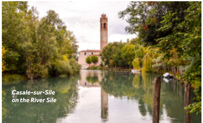
Casale-sur-Sile on the River Sile

Moorings: There is a cement jetty beneath the church tower and a long wooden jetty in the shade of the trees just behind.