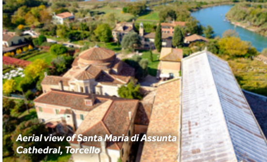
Aerial view of Santa Maria di Assunta Cathedral, Torcello

The most important archaeological site in the Lagoon, Torcello dates back to the Roman Empire. Torcello's main attraction is the Basilica di Maria Assunta, founded in 639, is Venice's oldest cathedral, and one of the most beautiful, with intricate mosaics decorating its floor and walls. Its bell towers afford stunning views across the lagoon, and you can also listen to an audio-guide to learn more about the church's history. The adjacent Museum has Roman and Byzantine collections on display. A stroll to the other end of the island will take you past the famous Cipriani restaurant, once frequented by Ernest Hemingway, and the so-called "Devil's Bridge", said to be haunted by the Devil.