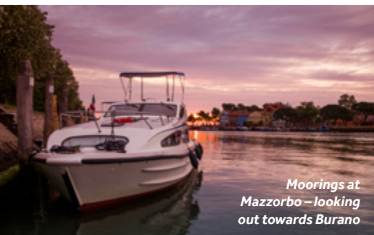
Moorings at Mazzorbo – looking out towards Burano

Moorings: Moor at Mazzorbo and take the waterbus to Torcello from Burano. Alternatively, there are wooden docks underneath the island's bell tower – ensure you tie your lines to the steel rings set in stone.