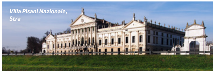
Villa Pisani Nazionale, Stra