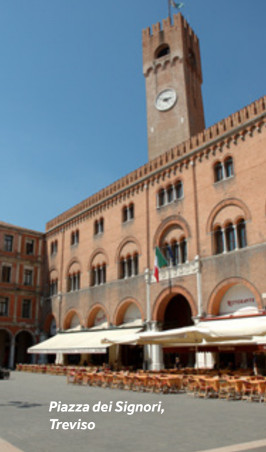
Piazza dei Signori, Treviso