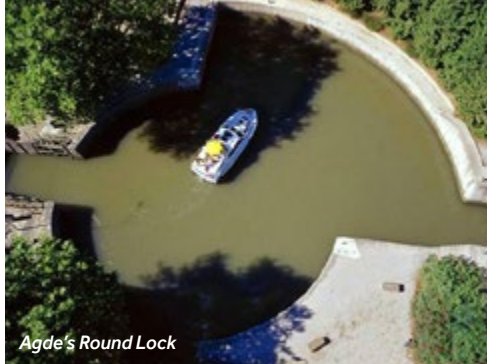
Agde's Round Lock

Agde is an ancient Greek city largely built using volcanic rock. Walking through its cobbled streets you can discover its ramparts, mansions and 12th century cathedral carved from black basalt. At the Éphèbe Museum, admire the city's buried treasures which span 2600 years, with many found in Roman shipwrecks. Then take the footpath that goes to the St. Loup Mount, an extinct volcano which is now a protected nature reserve offering exceptional views.