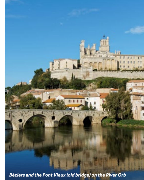
Béziers and the Pont Vieux (old bridge) on the River Orb

Recommended restaurant: La Gibrine. Ask the base team to arrange a taxi or, if walking, head towards Plage Est.