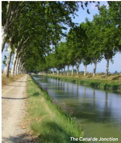
The Canal de Jonction

Just outside Agde the canal will bring you to Agde Round Lock. When it was built in the 17th century, the lock was perfectly round, but it was extended in 1984 to accommodate larger barges. It has the distinction of having three gates: two gates access the Canal du Midi, whilst the third opens onto the Hérault River (although rental boats are not allowed on this route).