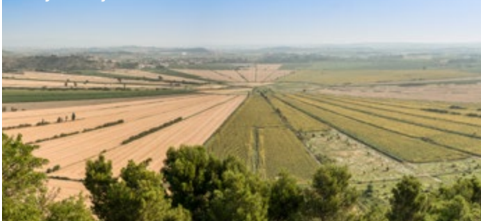
The dry Montady Lake

Amenities: There is a pleasure port here with fresh water (you'll need to buy tokens) and an electricity point. There is a supermarket, pharmacy and newsagents right at the port. After a 300m stroll into the village, you'll find a lovely patisserie and more restaurants.