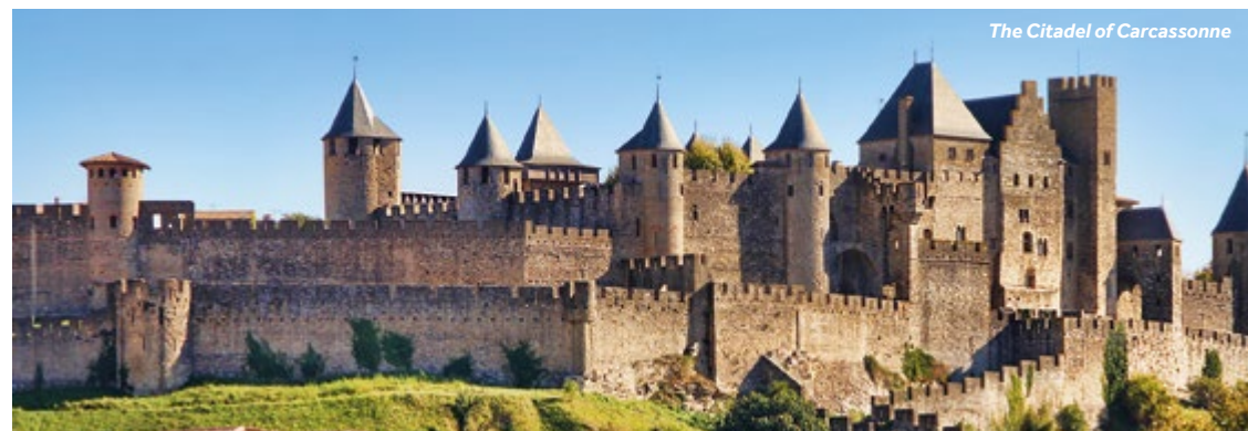
The Citadel of Carcassonne

Amenities: There is a Spar supermarket 1.1km away in the town centre, where there are also ATMs, etc. If you spend over €100 they will usually be able to deliver your goods to your boat.