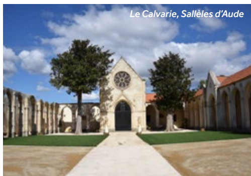
Le Calvarie, Sallèles d'Aude

Amenities: In the village centre, there are a couple of grocery stores, a bakery and several restaurants.